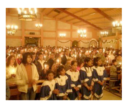
"...ended the mass by passing out candles and singing songs together. The church looked and sounded absolutely beautiful."