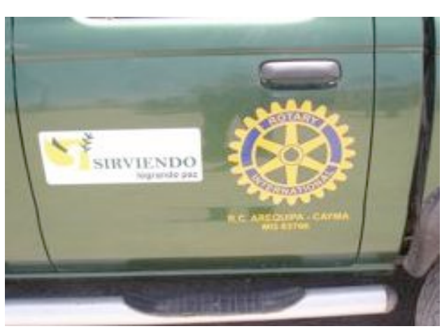
The Police Vehicle Donors