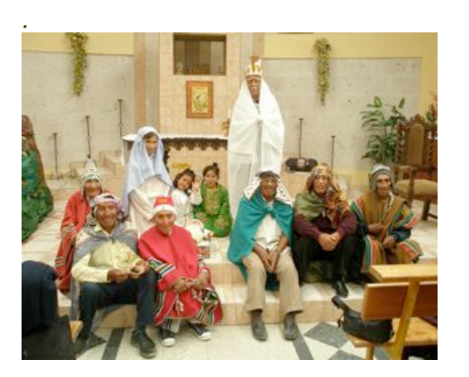
The Christmas Pageant presented by the Senior Group."

Each month we will highlight a part of the mission, its history and its future, as well as some of the organizations that work closely with the mission. This month we are focusing on The Policlinico Maria de las Misiones, CPR (Center for Personal Restoration and HBI (Health Bridges International).