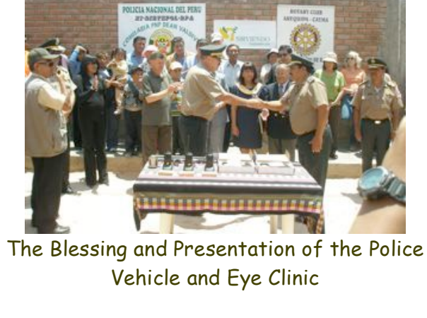
The Blessing and Presentation of the Eye Clinic