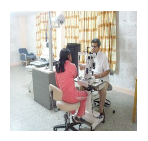
"The new eye clinic seeing one its first patients. Everyone is excited for the new service the clinic is able to provide."

At times offering the specialties of ENT, Endocrinologist, Pediatrics, and Ophthalmologist with plans to increase the availability of more specialists in the future.