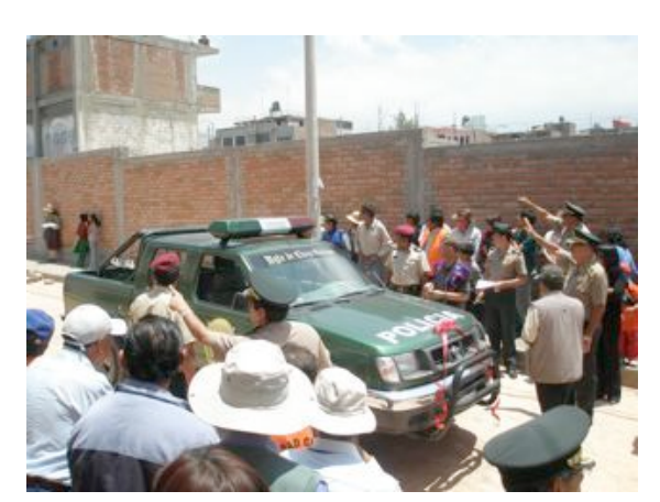
The Police Vehicle